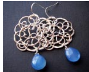
The artist behind Lizzy B Designs will be at Sunnyside, 5-8pm.

Plus, during the day, don't miss National Gaming Day —bring the family and play good, old-fashioned board games all day—and the Second Saturday Book Sale (9am-2pm)—both at the Library.