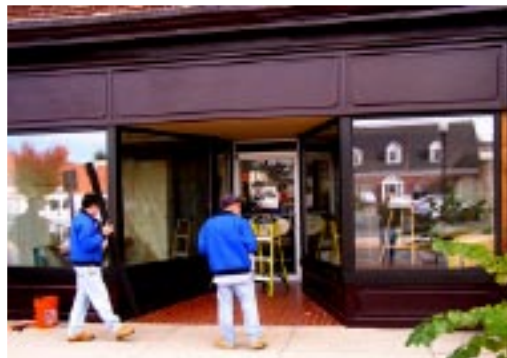
New windows at A Few Of My Favorite Things were one of the facade projects.

All applications for this program need to be in by mid-December. So far, the program has helped 13 applicants make improvements to 17 different properties! That includes ongoing projects at A Few of My Favorite Things and Dragonfly, where all that plywood lately is a sign of great progress!