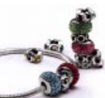
Lednum's has a bead special.